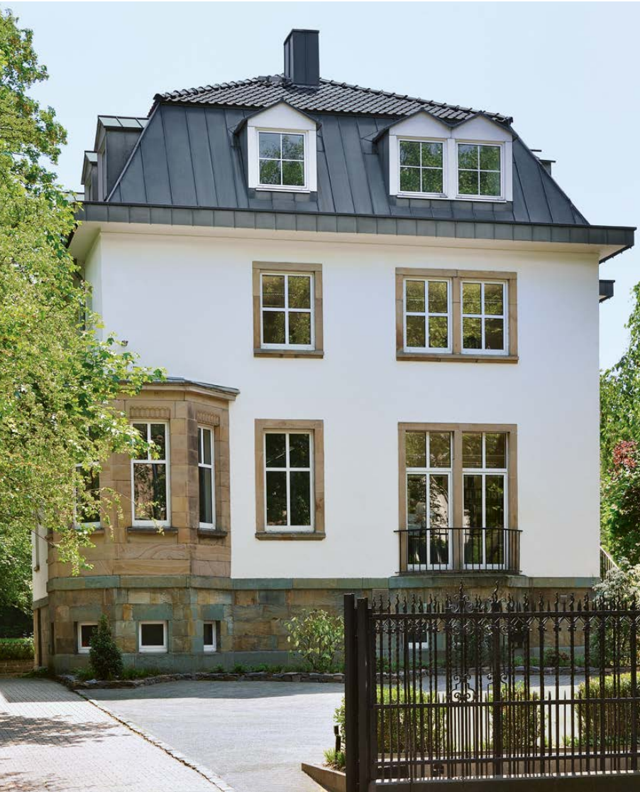
Owner-occupied head office in Cologne-Marienburg

The Marienburg district of Cologne has its origins in the middle of the 19 th century.